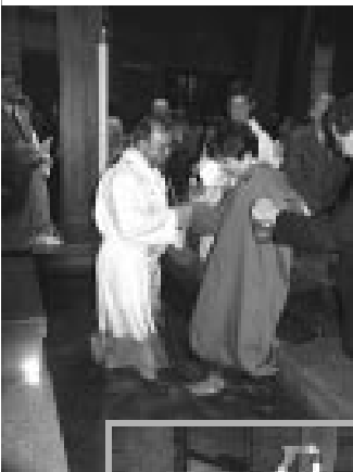
Below: Confirmed in the Spirit.