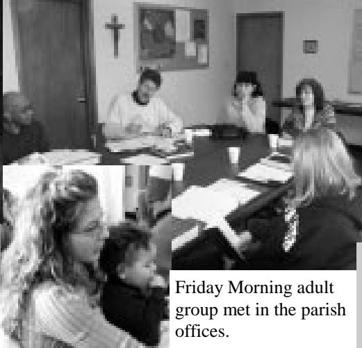
Friday Morning adult group met in the parish offices.