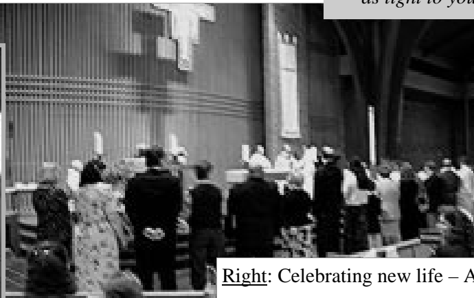
Right: Celebrating new life – Alleluia!