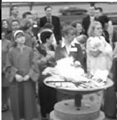
Left: The cleansing waters of Baptism.