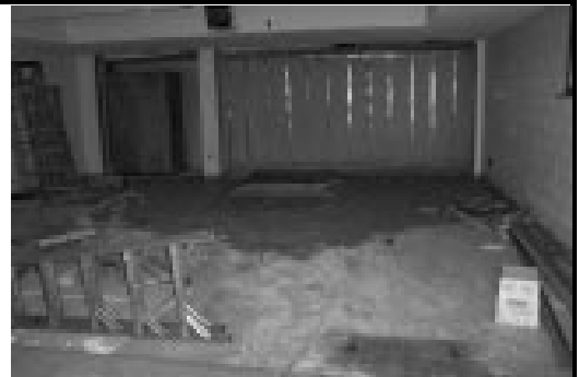
One of our first goals was to install a support system for underneath the new baptismal

We are very happy with the progress. Thanks again to all of you who provided financial support to make our church more user-friendly for the handicapped, those who are grieving, and families with young children.