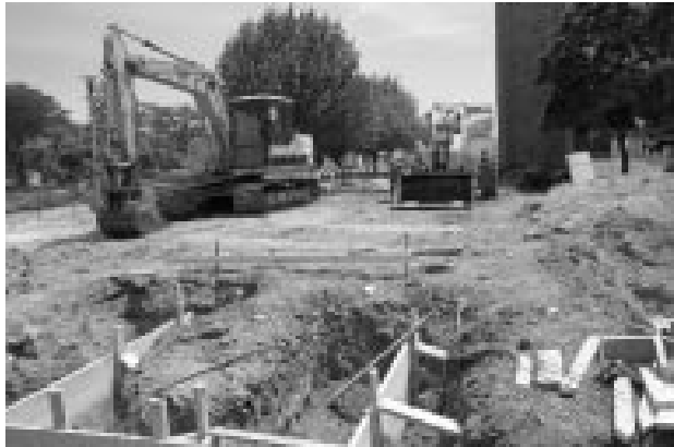
Before we could begin to build we needed to tear down the old plaza and install new foundations

Anyone beginning a renovation project expects a few trials and tribulations. Since old blue prints don't always show what hides beneath those walls or that cement, pipes and problems sometimes surface as one rips down to re-build.