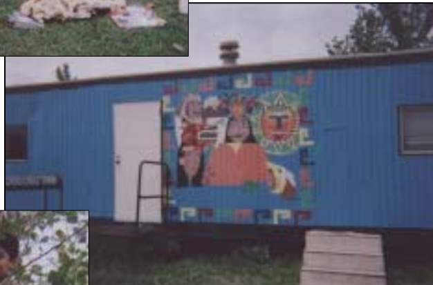
Lending Library trailer

children's books (nearly 1000 books) from parishioners at St. Francis weekend masses, and from students at Vacation Bible School. We are organizing a lending library at the camp and we continue to have a book reading time with the children