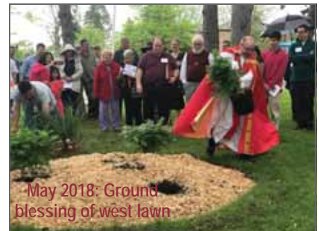
May 2018: Ground blessing of west lawn