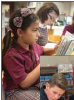
St. Francis School students at work

Religious Education and St. Francis of Assisi School grew in numbers and continued to shine as vibrant ministries of the parish. St. Francis School saw enrollment continue to increase, to provide creative and constructive professional development to the faculty and staff, and to make improvements to the school facilities including the library, and gymnasium. A review and update of the school's science curriculum has been planned for the coming school year. School students were enriched through learning about