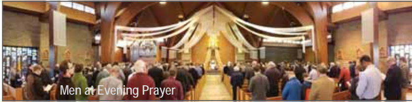
Men at Evening Prayer