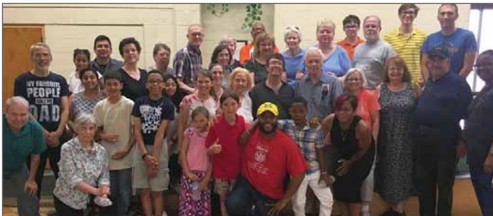
2018 Food Drive for Kids—delivered to our Detroit sister parish

St. Francis Parish advanced in its outreach to the poor, the homebound, and those in any kind of need. Training and education for Stephen Ministers were conducted at the parish during the past year. Regular and extraordinary food drives and fundraisers for the poor in our region and throughout the world, particularly in the Diocese of Kottappuram in India, successfully raised awareness among parishioners that human need knows no borders or bounds. Continuing education on the Church's concern for the poor, the natural environment, and for the migrant fueled the drive of parishioners to seek justice both in theory and in deeds.