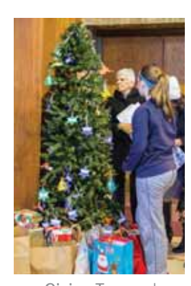
Giving Tree and Food Drive