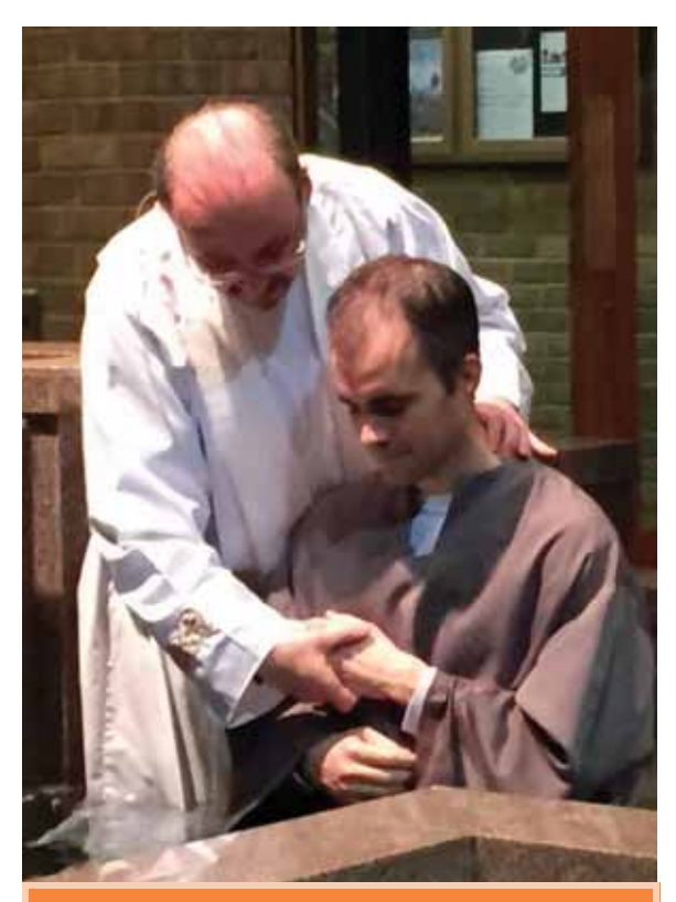
The Elect are born in the waters of Baptism.

At the Easter Vigil, the Elect and Candidates reach the apex of their long journey to initiation in the Catholic Church. The Elect receive the sacrament of Baptism, then, along with the already baptized Candidates, they are sealed with the Chrism of Confirmation and share the Eucharist as full members of the Roman Catholic Community.