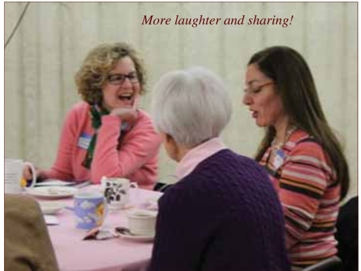
More laughter and sharing!

The Women's Faith & Fellowship group meets monthly to share faith, fellowship and FUN! Plan to join us for our next event on March 11.