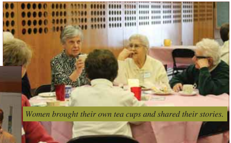
Women brought their own tea cups and shared their stories.