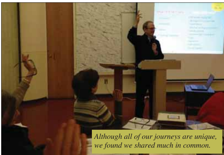
Although all of our journeys are unique, we found we shared much in common.