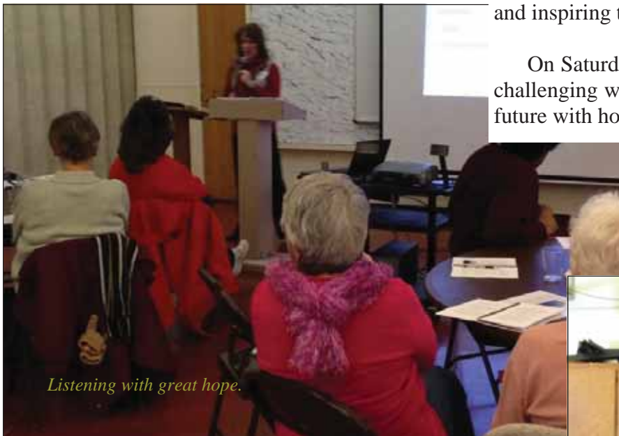
Listening with great hope.

On Saturday, we rolled up our sleeves and got to the challenging work of grieving, sharing and looking to the future with hope.