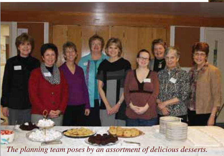
The planning team poses by an assortment of delicious desserts.