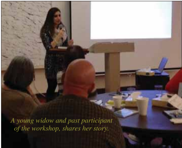
A young widow and past participant of the workshop, shares her story.