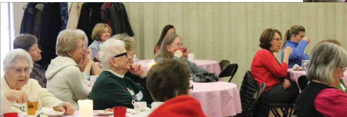
Smiles and laughter filled the air.