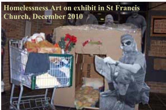
Homelessness Art on exhibit in St Francis Church, December 2010

Now through our Parish Lenten Service Project to Sack Homelessness , we are learning more about homelessness in our area—which organizations assist people, as well as, what adults and children can do to help. The March 6 th weekly parish bulletin contained a SACK HOMELESSNESS! Sack, and the 2011 Lenten Calendar of Activities which are helping us to really make a difference.