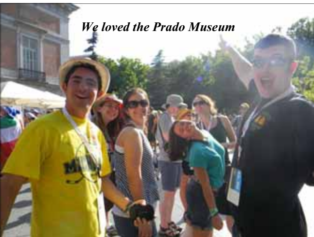
We loved the Prado Museum

From the sessions, each day we did something different. On Wednesday we went to the Prado museum ( photo left ). Thursday was the Papal Welcome. Friday was the Way of the Cross. On Saturday we woke and then headed to breakfast. We wanted to enjoy a good meal before we began the 6.5 mile pilgrimage journey to the overnight vigil ( photo below ). The temperatures climbed to 105 and we were exhausted. Our group was fantastic - didn't complain, helped each other, and made sure to stay hydrated. They constructed shade shelters with the tarps we had brought and everyone napped in the heat of the afternoon. The overnight vigil brought rain and high winds. The winds interrupted the vigil with the Pope, and even affected some of the constructed shelters made by WYD for chapels. Sunday brought the closing Mass with the Pope.