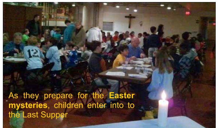
As they prepare for the Easter mysteries , children enter into to the Last Supper