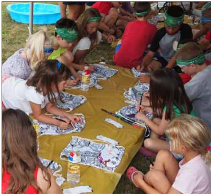
During Vacation Bible School this past summer, children decorate backpacks ( above ) before placing them in the dye.