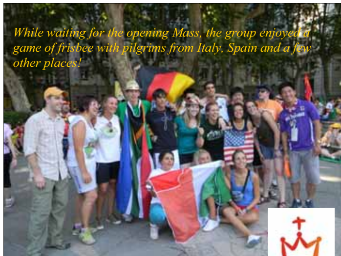
While waiting for the opening Mass, the group enjoyed a game of frisbee with pilgrims from Italy, Spain and a few other places!