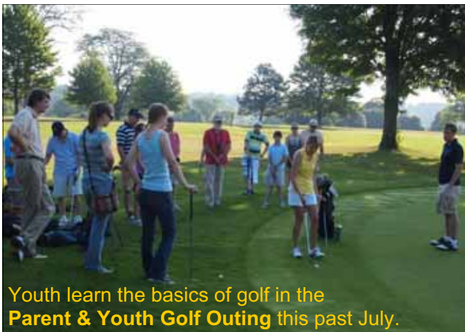
Youth learn the basics of golf in the Parent & Youth Golf Outing this past July.

( right ) The love of God permeates the teaching in the Preschool Enrichment program.