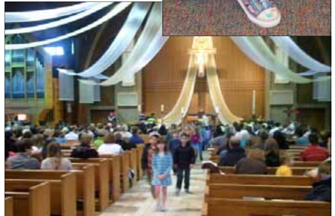
Children ( above ) are invited to process to the chapel for the Children's Liturgy of the Word during the 8:45 & 10:30 a.m. Sunday Masses.