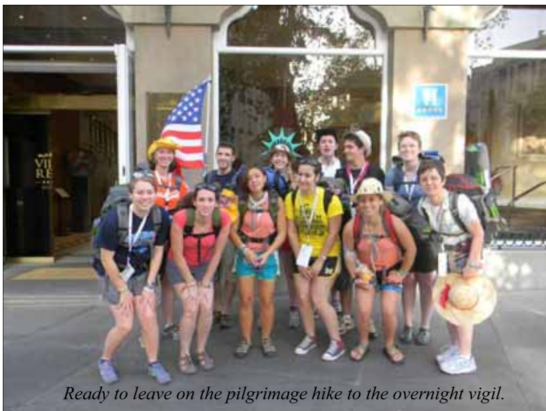
Ready to leave on the pilgrimage hike to the overnight vigil.