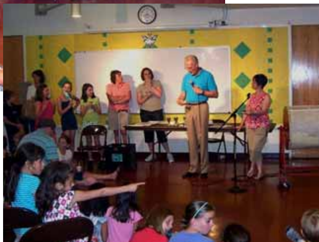
Left: Announcing the Grand Prize Winner