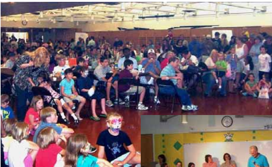
Above: Awaiting Results in the P.A.C.

Over the years, the learning environment at St. Francis of Assisi School has improved significantly as a result of Car Raffle proceeds. The money raised has gone directly to the school's operating budget to help keep tuition affordable, as well as to help purchase needed improvements including student textbooks and desks, media center and classroom computers, lighting upgrades, windows, and air conditioning. Car Raffle proceeds have also provided essential revenue to pay teacher salaries.