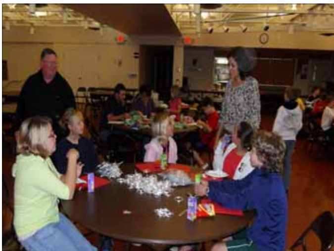
(Below) A parent oversees the work of the children as they interview each other as part of Family Religious Education.