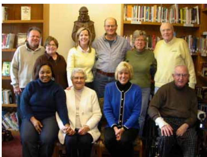
Some members from the Tuesday morning small group pose for a photo