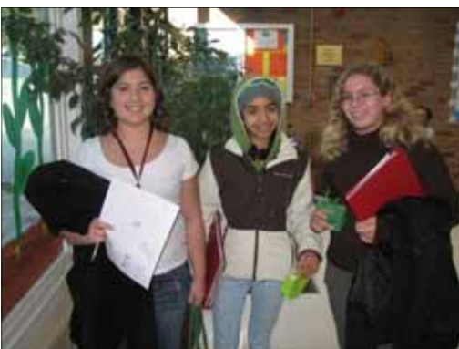
Pictured: Youth in middle school walk to their classrooms after gathering together in their own large group session.