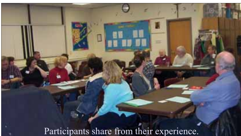
Participants share from their experience.

Ten people from the training signed up to facilitate small groups this Lent! Armed with this training we hope for some wonderful small group experiences to share with you in the next newsletter!