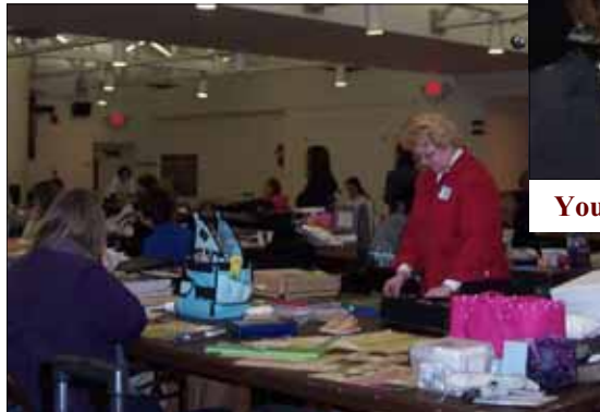
Scrapbookers spread their supplies and photos out on tables and get organized!

Participants were glad to have the time and place to be with friends new and established as they created lasting books of precious memories.