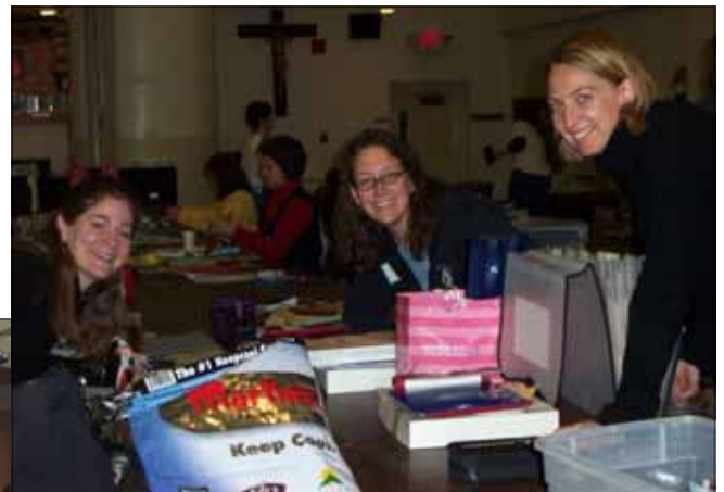
Young moms share photos and stories of their babies