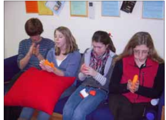
Using play dough to think about Creation.