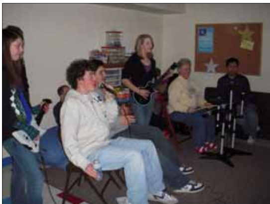
Rock Band! With teens and the adult leaders playing, the talent was excellent and the entertainment was hysterical.