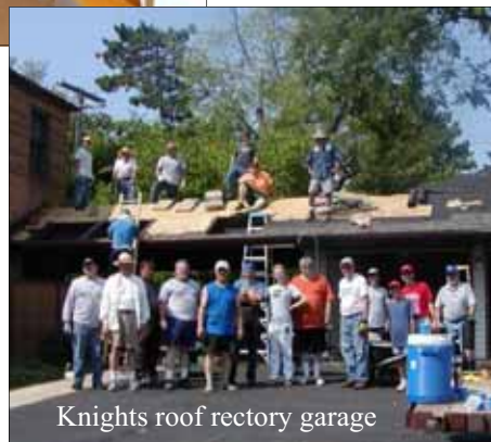
Knights roof rectory garage

An unanticipated project completed this summer was the waterproofing of the elevator pit in the School. This had been done a number of years ago and held up reasonably well until the last year or two, but the heavy snow and rains of the last two years have resulted in water occasionally entering the pit (one of the perils of the topography of our property). Water was found during a State inspection in June, and our contractor was able to correct the problem. We are hopeful that we will get many additional years of trouble-free service from the elevator before we need to have this work performed again.