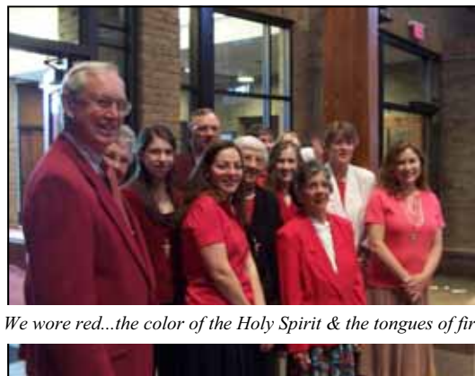
We wore red...the color of the Holy Spirit & the tongues of fire.