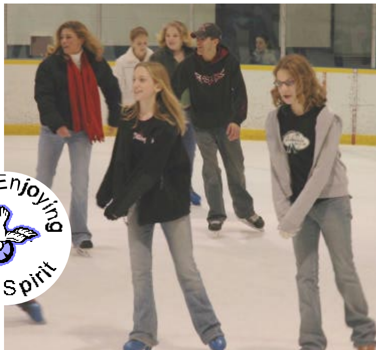
Having fun at the Y.E.S. Ice Skating Party in January.