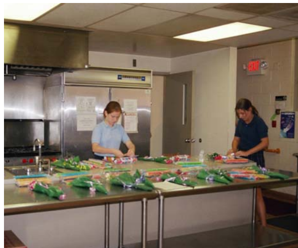
Middle School students prepare treat bags.

Middle school students donated their time and talent to decorate bags and fill them with Halloween treats for St. Benedict School, our sister Parish. We hope to establish a pen pal writing program with St. Benedict School, and possibly have St. Francis students and teachers visit and participate in a day at St. Benedict School to share our gifts.