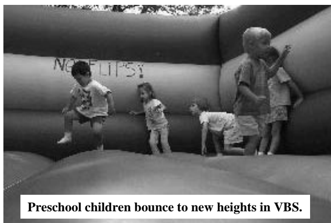
Preschool children bounce to new heights in VBS.