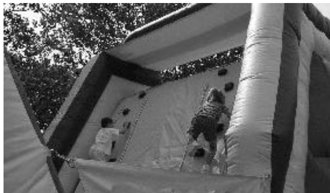
Taking on new challenges, children in grades 2 through high school climb “Faith Mountain.”

Thank you to the 121 volunteers—middle school, high school, and adults—for helping to create a community of Faith for the children. Thank you to the parishioners who donated the swimsuits and beach items to benefit inner city N.Y. children at their summer camp in Carrollton, Ohio the week of August 12. The camp is sponsored by Holy Family Ministries.