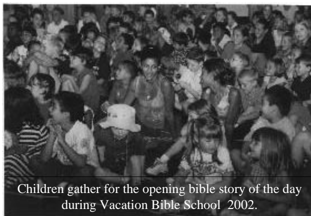
Children gather for the opening bible story of the day during Vacation Bible School 2002.