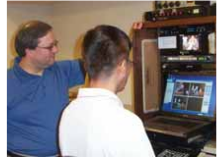
Video Ministry broadcasts the Sunday mass.