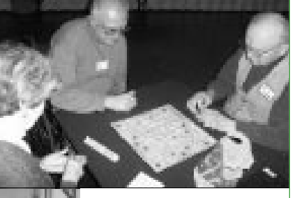
Seniors @ St. Francis meet monthly