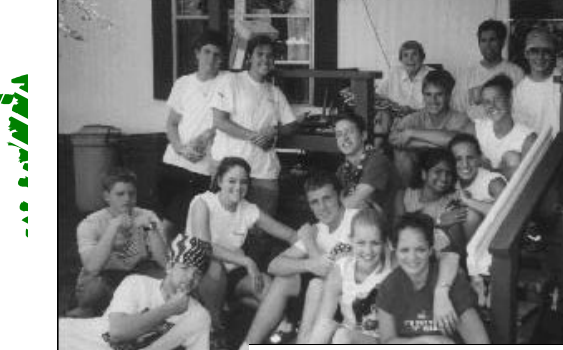
High School Youth summer service was in northern Michigan, while middle school YES ministry serves at a local YMCA program.