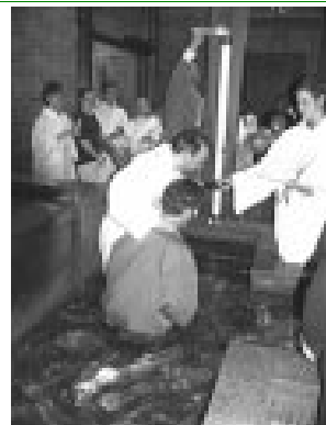
Our new baptismal font was used for the first time at Easter Vigil 2003.