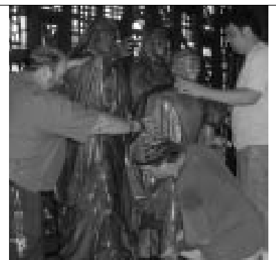
Holy Family Shrine reminds us of our pilgrimage in this life.