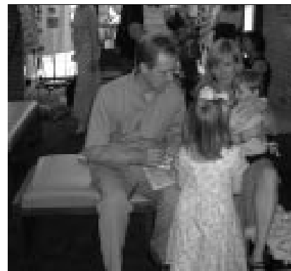
A space for parents to worship while attending to their child's needs.